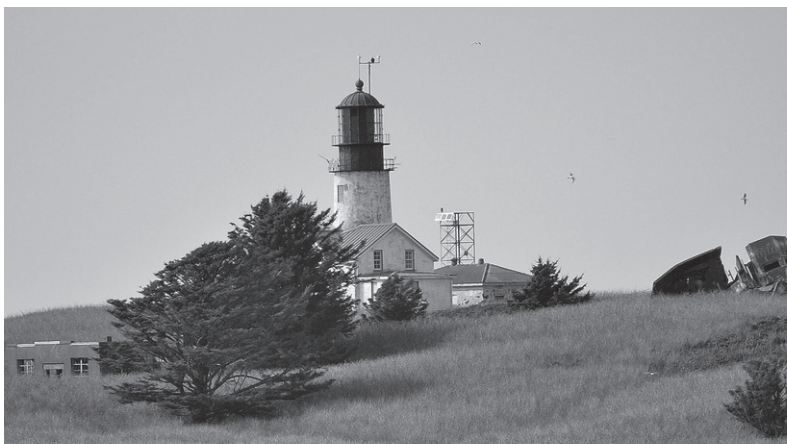
The Cape Flattery lighthouse, built in 1854 and automated in 1977, is owned by the US Coast Guard.

The two-minute video can be seen at www.samsung.com/solvefortomorrow .