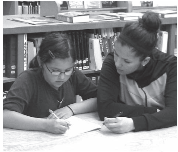
Left: Students in the Catalyst Corps/Mentor Buddy program steer a research vessel during a field trip in the Strait of Juan de Fuca. The field trip was made possible by an award from the Washington STEM program. Right: Mentor/buddy pairs partner for tutoring sessions three times a week.

natural intelligence — is the key to success in school and in life. Staff and students soon embraced this growth mindset philosophy with measurably improved results.