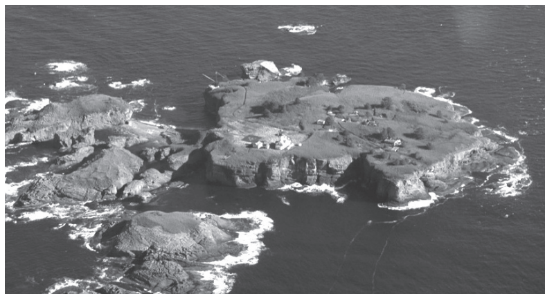
Tatoosh Island is the largest of a small group of islands just offshore of Cape Flattery. Access to the island requires written permission of the Makah Tribe.